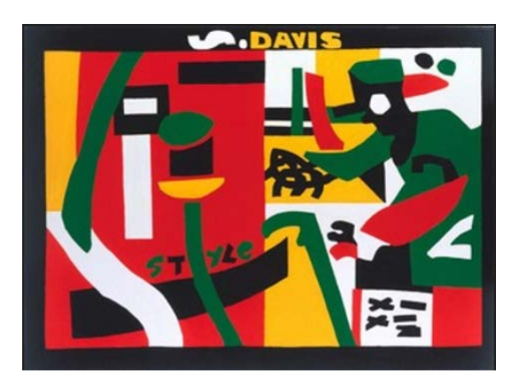
Night Life, Stuart Davis, 1962, oil on canvas